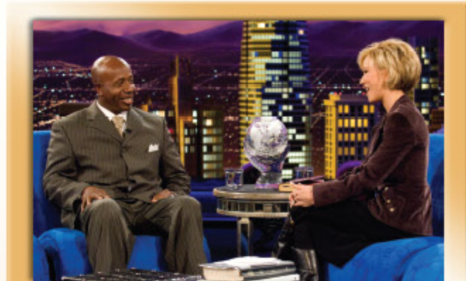
Paula White was host to three time Grammy award winning recording artist, MC Hammer. Hammer first made his mark in the music world in the 1980s. Since then, he has become a full time minister of the Gospel and now devotes his life to reaching souls for the Kingdom of God!