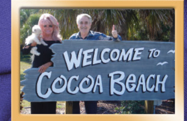
A great full power station, WTGL TV 52 serving Cocoa Beach/Orlando, FL, signed on the air last September. Yes, WELCOME to the TBN family!

Praise the Lord JANUARY 2007 · VOLUME XXXIV · NUMBER 1