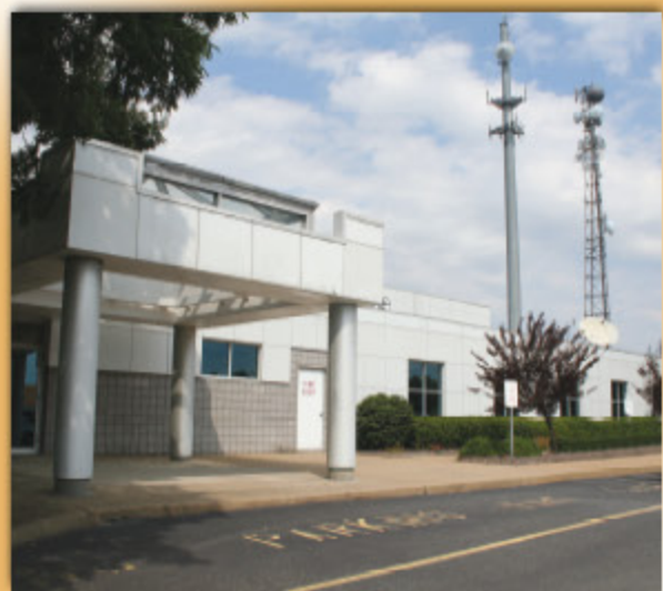
Pictured is the building housing TBN's new, Virginia Beach, VA station—WHRE TV 21. On the air since last March, WHRE covers the vast Tidewater metropolitan region of Virginia, blanketing over 1.9 million souls! Yes—HELLO VIRGINIA BEACH!